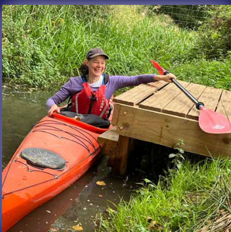
A safer landing stage with an extra step

Thanks to your feedback, we've already made upgrades, including: