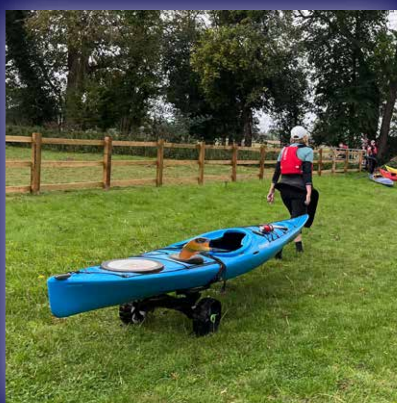
More trolleys for moving boats