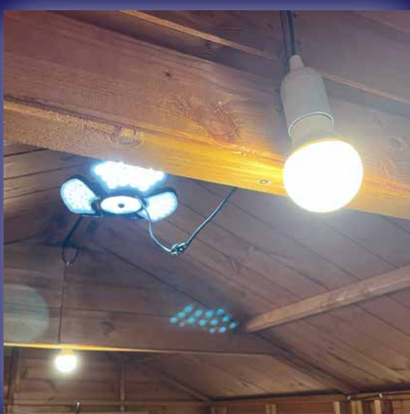
New lights for early/late paddles