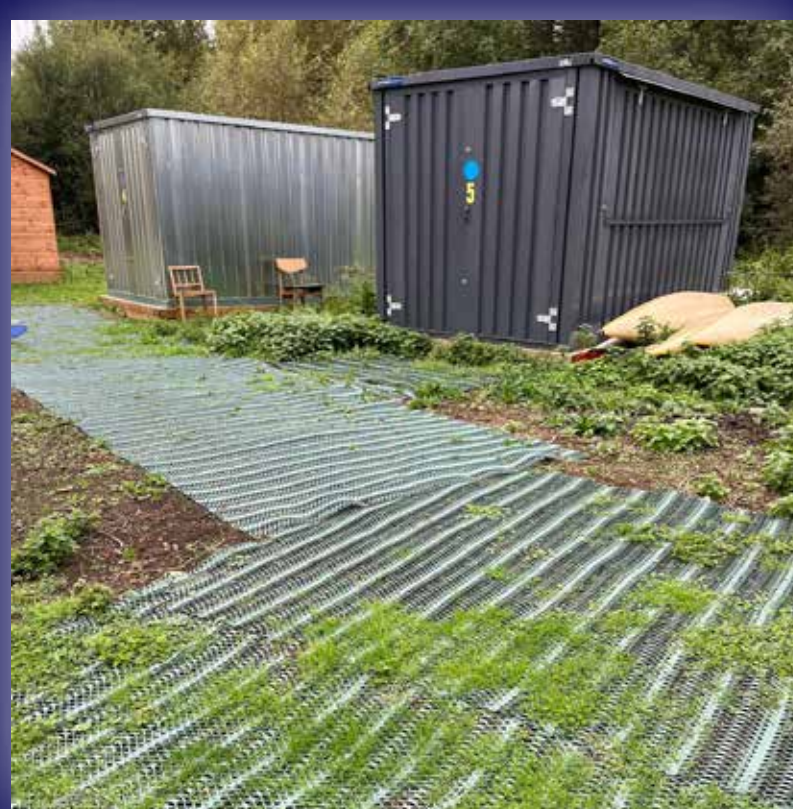
Ground matting to keep things stable and clean